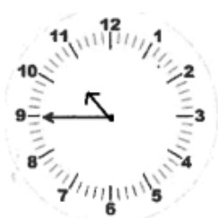
Kolmveerand üksteist '10:45'