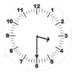
Pool neli '3:30'