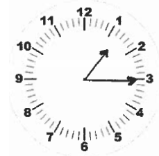
Veerand kaks '1:15'