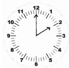
Kell on kaks 'It's 2:00'