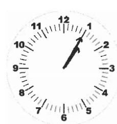
Viis minutit üks läbi '1:05'

Here are some numbers in English and Estonian: